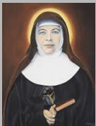
The wisdom of St. Mary MacKillop

“Let self be forgotten and let God’s glory, His will and the general good absorb our thoughts, deliberations and actions.” 9.9.1875